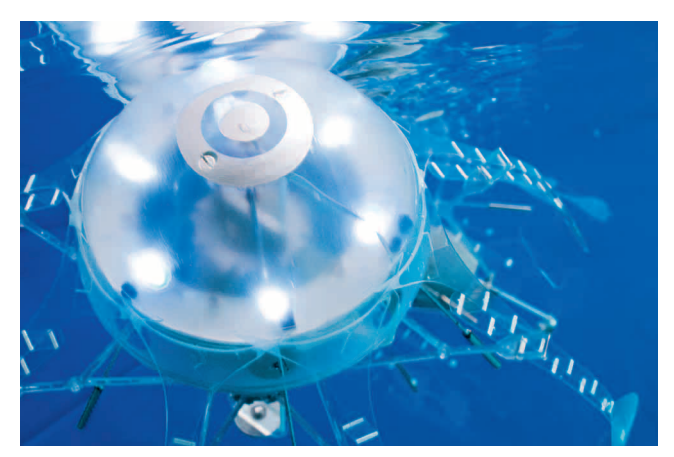
Energy transfer via two integrated contact points

The jellyfish's sensor system comprises three components that use different media. A pressure sensor makes it possible to determine AquaJelly's depth in the basin to within a few millimetres. AquaJelly is thus aware of its precise position at all times and can position itself within a specific pressure zone. It also relies on the pressure sensor for recharging, since this is the only way it can strategically swim to the surface. For communication at the water's surface AquaJelly uses the energy-saving ZigBee® short-range radio system, which enables it to exchange data with the charging station and to signal to other AquaJellies at the surface that the station is occupied. The radio waves penetrate to a physically determined minimal depth, and AquaJelly must decide within a narrowly defined range which charging station it will approach.